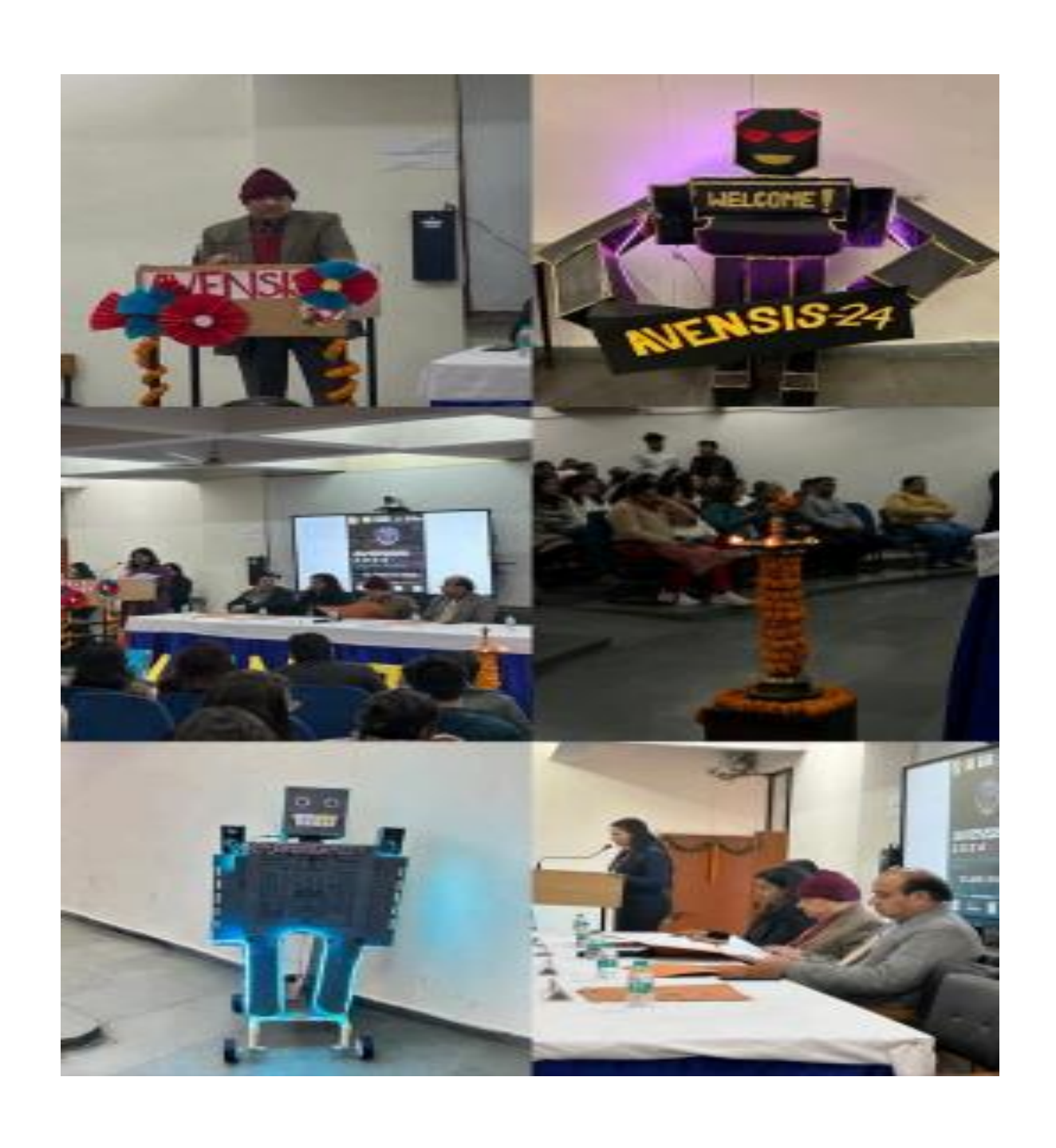
Inaugural Ceremony of Avensis 2024