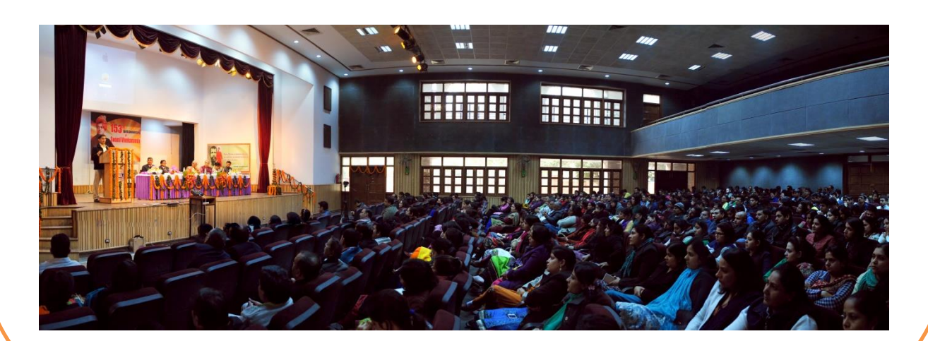
Guests and Dignitaries