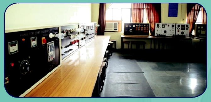
Tthe department is actively engaged in research and teaching activities in

the field of Power Systems, High Voltage Engineering, Advanced Control Systems, Power Electronics and Drives, Signal Processing and Energy Studies. Various Labs in the department are: