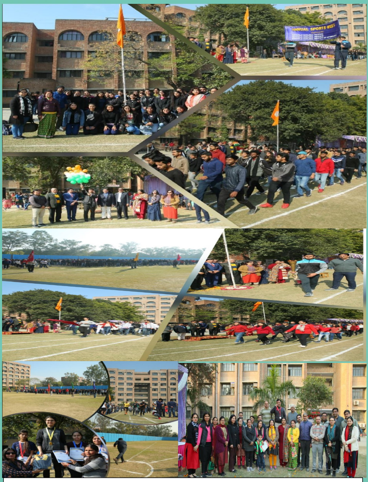
Annual Sports Day 2020