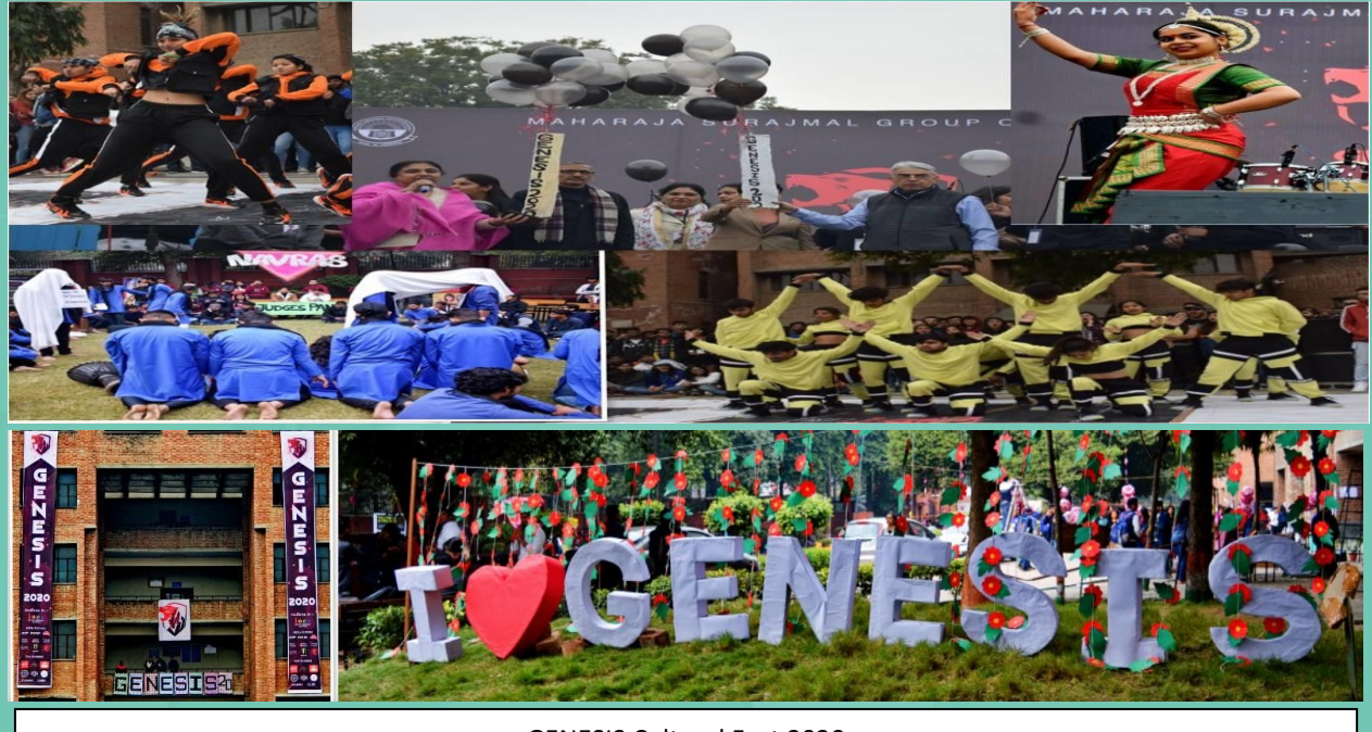
GENESIS Cultural Fest 2020