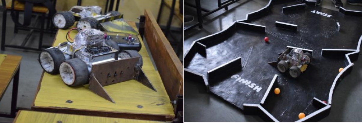
AVENSIS MSIT ANNUAL Fest 2020