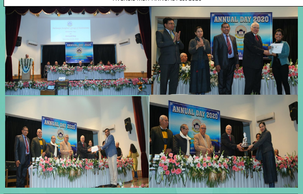
Annual Day 2020 Celebrations