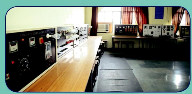
Tthe department is actively engaged in research and teaching activities in

the field of Power Systems, High Voltage Engineering, Advanced Control Systems, Power Electronics and Drives, Signal Processing and Energy Studies. Various Labs in the department are: